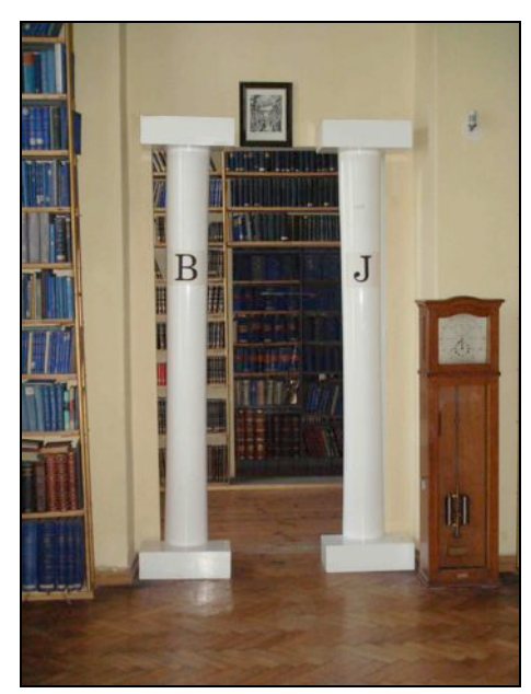
Detail of the reading room in the Masonica collection of Ciążeń

Most of the first floor rooms perform representative functions. This is where the reading room of the Masonic collection is situated. The library features about 4,000 volumes of the most important titles of books and periodicals with best-preserved bindings. The arrangement of the reading room clearly refers to the typical temple décor and the layout of a Masonic lodge: blue curtains and tablecloth, candlesticks, two columns and the so-called Masonic carpet. On the walls hang reproductions of characteristic Masonic engravings. Visitors have free access to books. The items from the collection are made available only for personal inspection in the reading room of the palace or, failing that, upon an earlier request in the reading room of the Special Collection Department at the Library in Poznań.